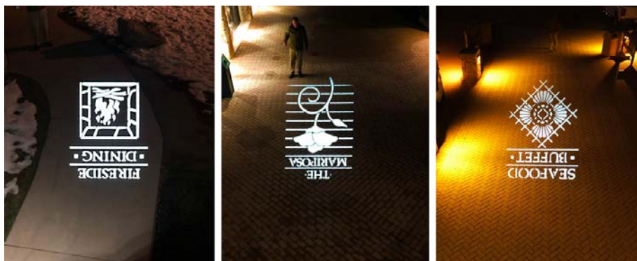
Custom Steel Image Spot Gobos welcome guests as they approach Deer Valley Resort restaurants