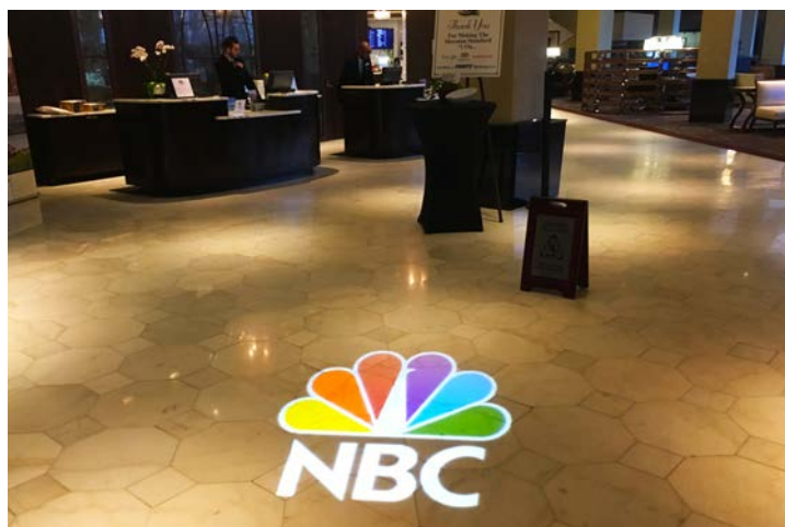
Sheraton-Stamford welcomes NBC employees with their projected logo in the lobby