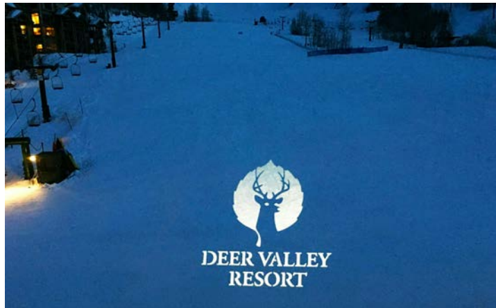
An Image Spot projects the Deer Valley Resort logo onto the snowy mountainside